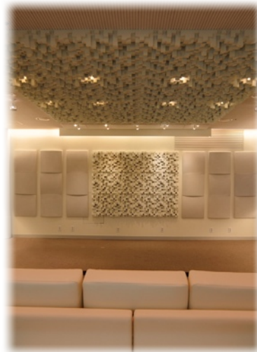
Fi Fi room - Korea