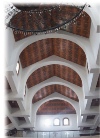
Church - Lebanon